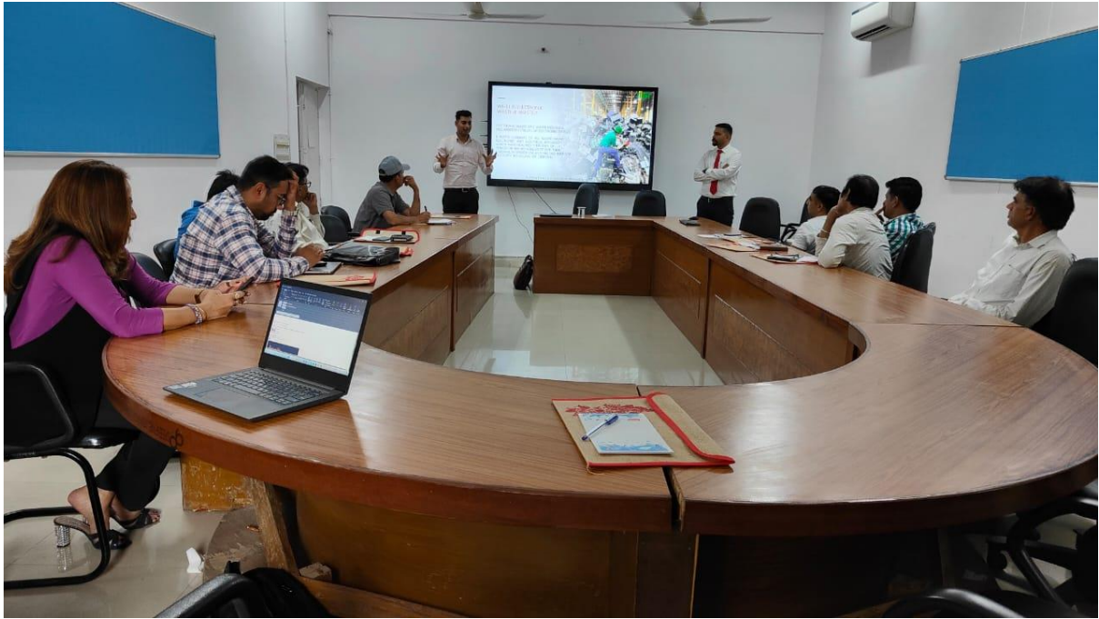
Picture 2- Presentation on the handling of E-Waste by team MAIT