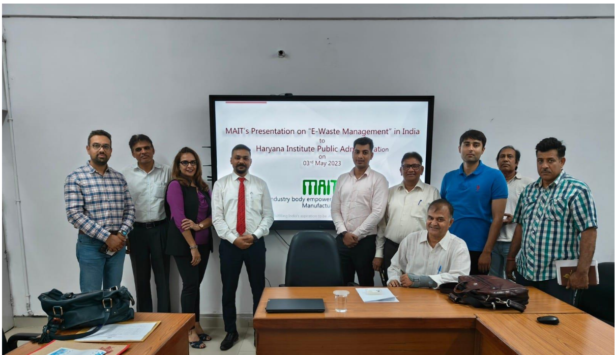
Picture 3- MAIT members and Officers at the day 01 of Training