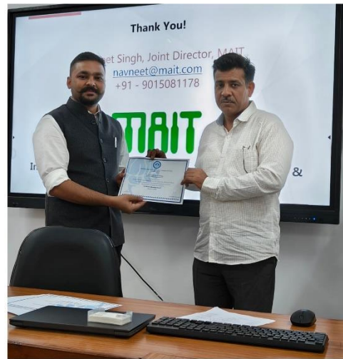
Picture 4- HIPA honoured MAIT by requesting to distribute certificates to the officers