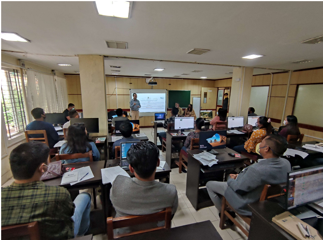
Picture-1: Participants from North East States attending the sessions on e-waste management.

As of 31 st August 2021, 3 nos. batches have been conducted and a total of 57 nos. candidates from the 8 NE states have been trained on e-waste dismantling and segregation.