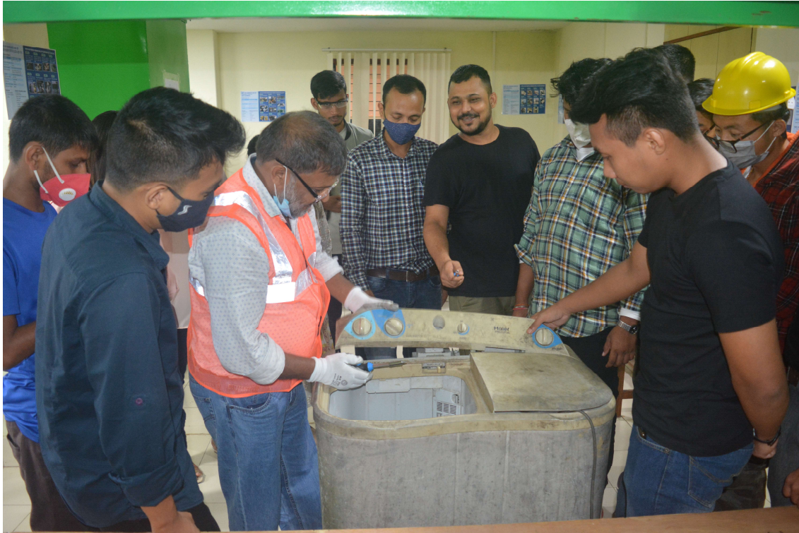
Picture 5: Participants attending the practical sessions at NIELIT, Gangtok