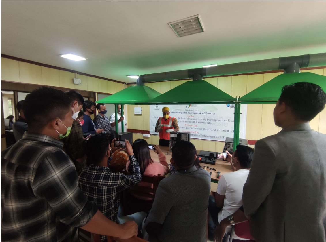
Picture 3: Participants during the practical sessions at the E-Waste Dismantling and Segregation lab setup under the project at NIELIT Gangtok