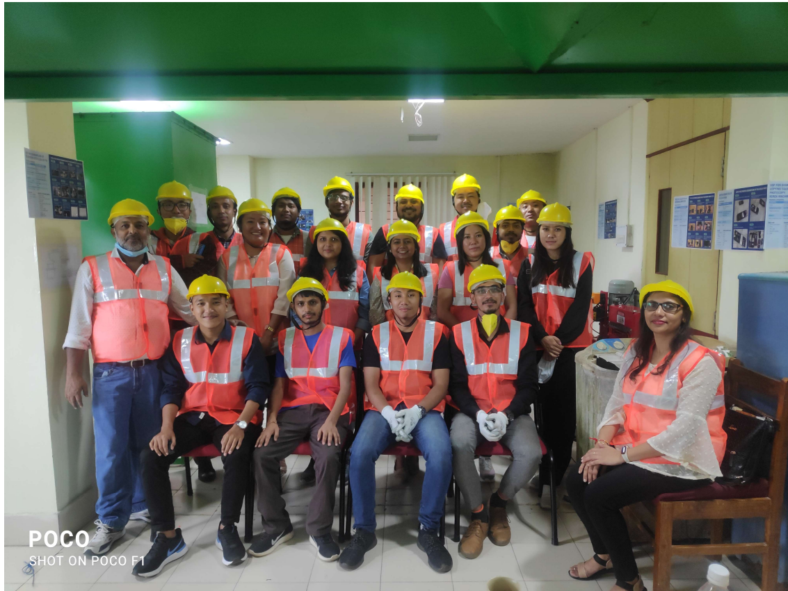
Picture 4: Group photo of Participants from the North East states attending the E-Waste Entrepreneurship Development Training Program at NIELIT Gangtok