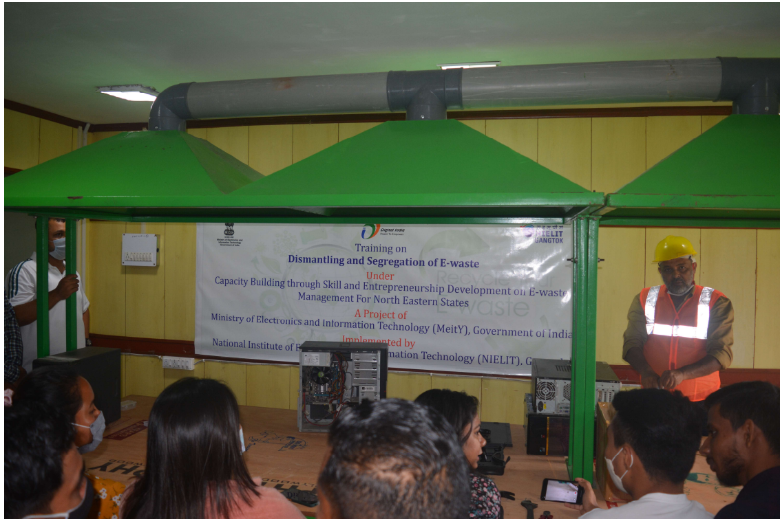
Picture 7: Practical sessions on e-waste dismantling and segregation at NIELIT Gangtok