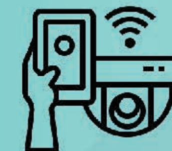
CAMERAS (SAFETEY SECURITY)