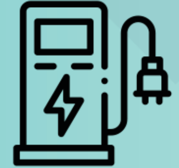
ELECTRIC VEHICLE SUPPLY EQUIPMENT